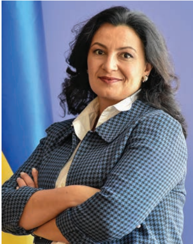
Photo of Ivanna Klympush-Tsintsadze, Vice-Prime Minister of Ukraine on European and Euro-Atlantic Integration